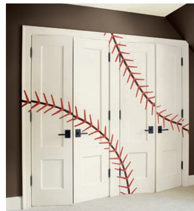
Walls and Arcs: Charred 440-7DB Ceiling and Doors: White Linen 007W Stitching: Red Rainboot 205-6DB