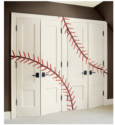
Walls and Arcs: Charred 440-7DB Ceiling, Doors and Trim: White Linen 007W Stitching: Red Rainboot 205-6DB

Tip: Depending on the arc color and the stencil color, a second coat of paint may be needed for added coverage.