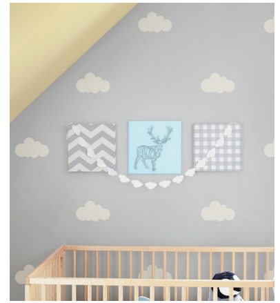
Wall: Fair-Minded Gray 438-3DB Clouds: White Linen 007W Build-out: White Whimsy 218-1DB

Use Dutch Boy® paint to ensure precise color match. Refer to the actual color chip for accurate color representation.